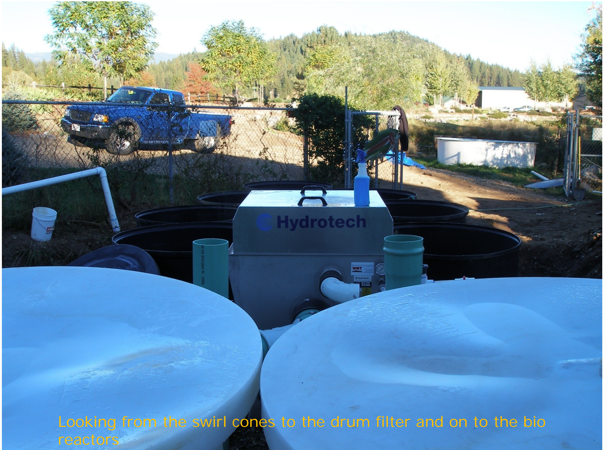
Looking from the swirl cones to the drum filter and on to the bio reactors